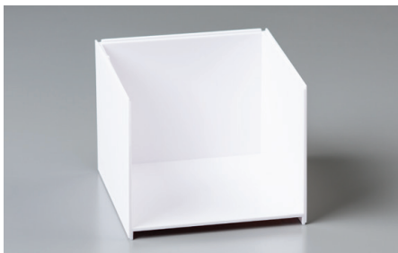
OPEN STORAGE CUBE ..... 149171 $10.00

Set of 5 white plastic trays. Each tray stores 6 Stampin' Blends markers. Stack several trays together or combine with other storage products. Peel-and-stick silicone feet are included to protect your surface and prevent slipping. Each tray: 5" x 5" x 7/8".