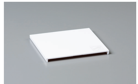
STORAGE LID ..... 149167 $3.00

One white plastic topper. Holds up to 20 Stampin' Ink Refills or other small items. Topper fits on top of Ink Pad & Marker Storage Trays, Stampin' Blends Storage Trays, and Open Storage Cubes. 5" x 5" x 1-1/4".