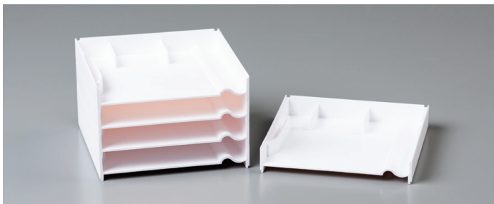
INK PAD & MARKER STORAGE TRAYS ..... 149168 $14.00

Give your creativity some style and structure with Storage by Stampin' Up! With various shapes and sizes to choose from, it's up to you to organize your crafting space your way. See all the storage options below: