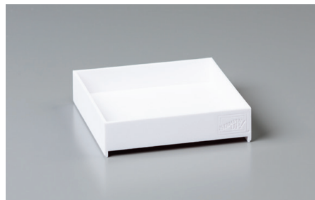
STORAGE TOPPER ..... 149170 $5.00

One white plastic cube. The open-front design lets you neatly stash small items such as embellishments, adhesives, ribbon, and more. Peel-and-stick silicone feet are included to protect your surface and prevent slipping. 5" x 5" x 4-1/16".